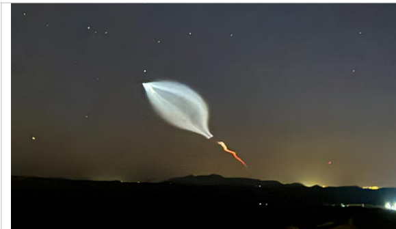
Firefly Aerospace Alpha rocket from

In July we were treated to the launch of the Firefly Aerospace Alpha rocket from Vandenberg. When the launches occur just at the right time shortly after sunset, we can see them.